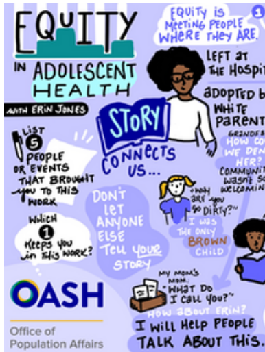
Image credit: Equity in Adolescent Health Visual Timelapse, OASH Office of Population Affairs, TPP Conference 2022